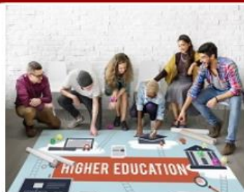
Higher Education CAO