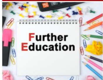
Further Education PLC